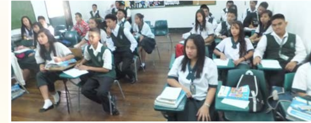
Spacious classrooms for a conducive learning atmosphere