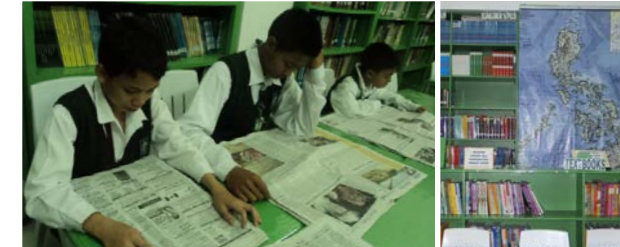
First Place: Fourth Division Search for the Most Functional School Library, Private School Category, March 2008