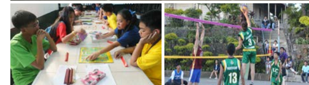
Active Student Development Center