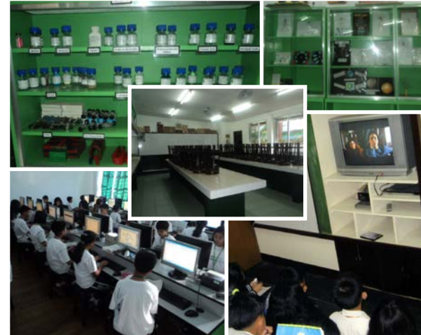
Sufficient facilities in workshops, computer room, audio-visual rooms, and other equipment for scientific propensity and work skills

As a foundation, all of the school's income is plowed back into upgrading its academic workers for continuing improvement of its facilities and financing of relevant educational researches. Also because of this, UC is able to provide its students with quality education at reasonable fee levels.