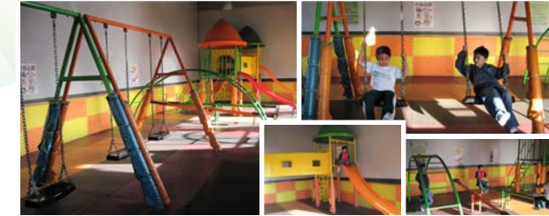
Safe and Clean Play Area